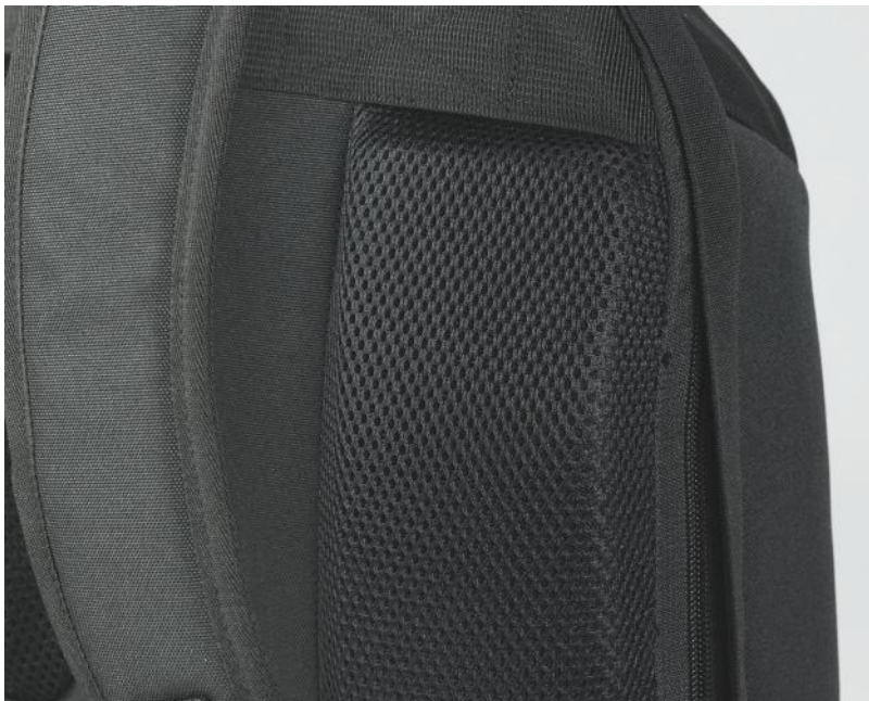
BREATHABLE BACK SYSTEM