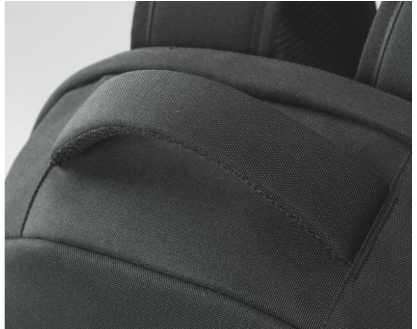
SOLID HANDLE AND STRAPS