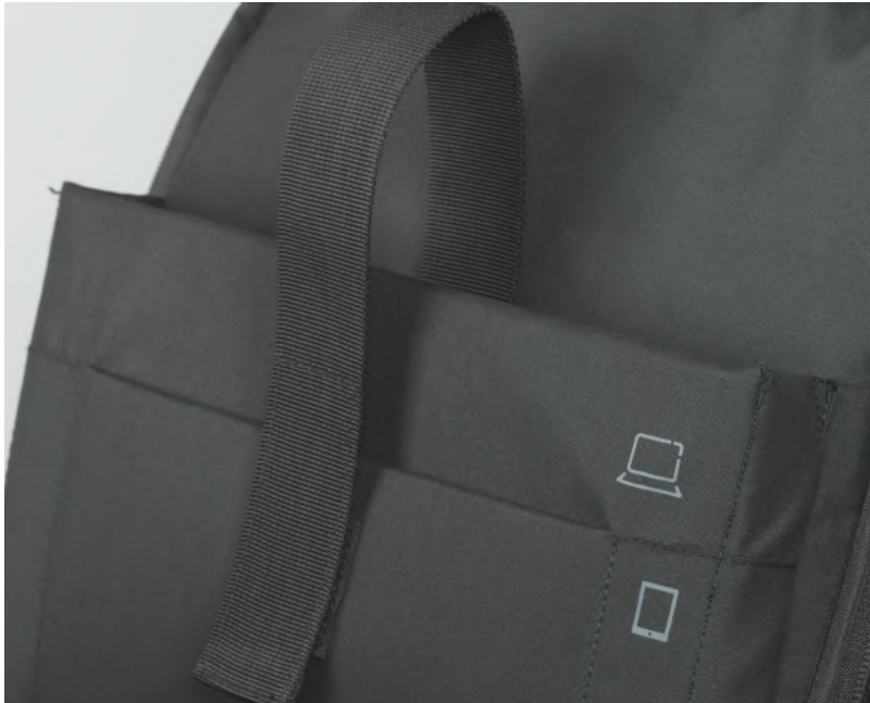
LAPTOP AND TABLET POCKETS